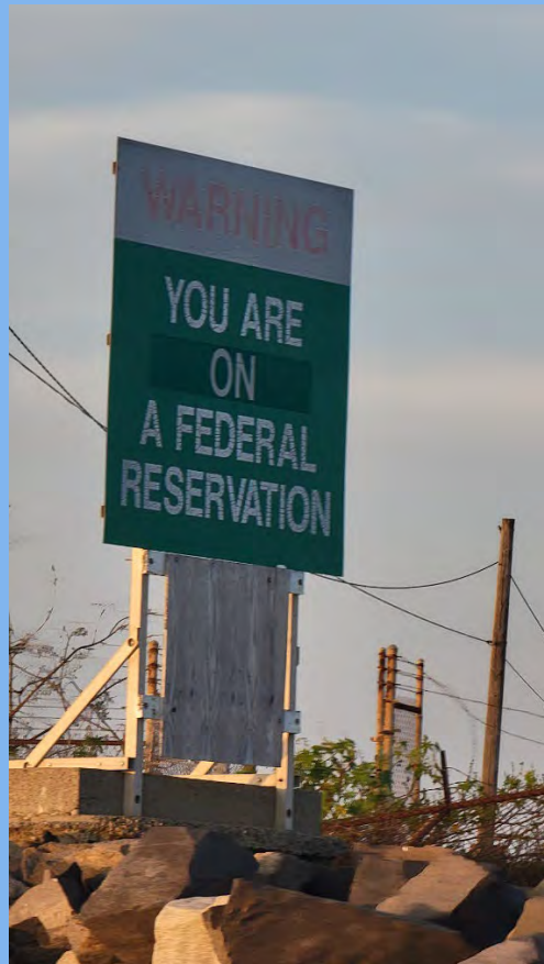
This sign puts you on alert as you enter the area.