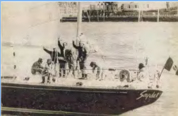
Carlin's Swan 65 "Saluya II", in an undated photo