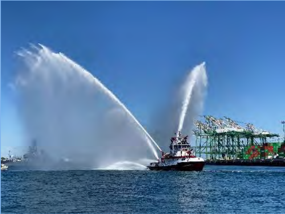
L.A. County fire boat 2 saluting the CBYC opening day.

Midwinters are not quite over – yes, I know its Spring, but Lake Gregory YC hasn't yet figured out how to do model yacht racing on a frozen lake, so they do their event in May – this year on May 11th.