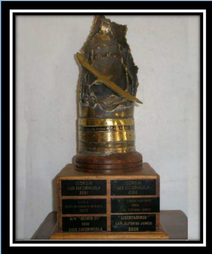
CNB Perpetual Trophy for Grandes Navegantes regatta