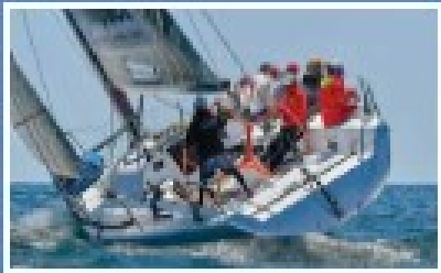
Competitive One-Design Teams