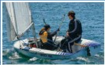
Newport to Dana Point, Short Course Dingy Race