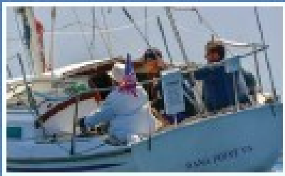
BHRF Club Racers