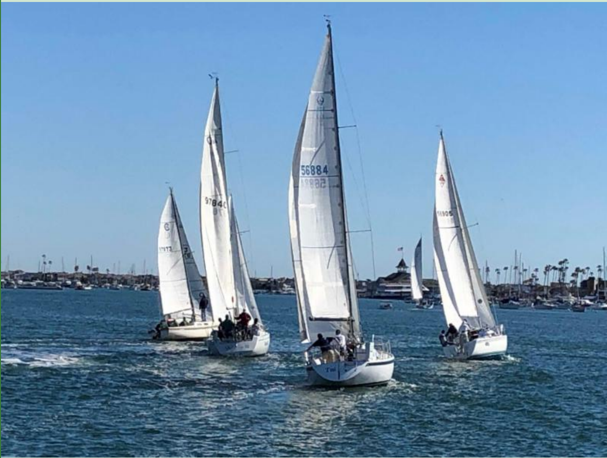
South Shore Yacht Club racers in Newport Harbor beating to the weather mark!