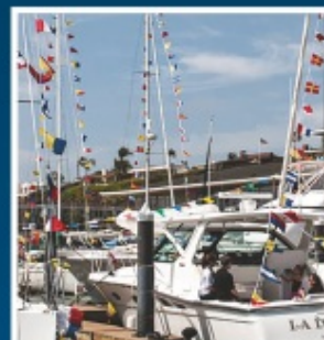
Hosted by: Bahia Corinthian Yacht Club