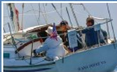
PDRF Club Racers