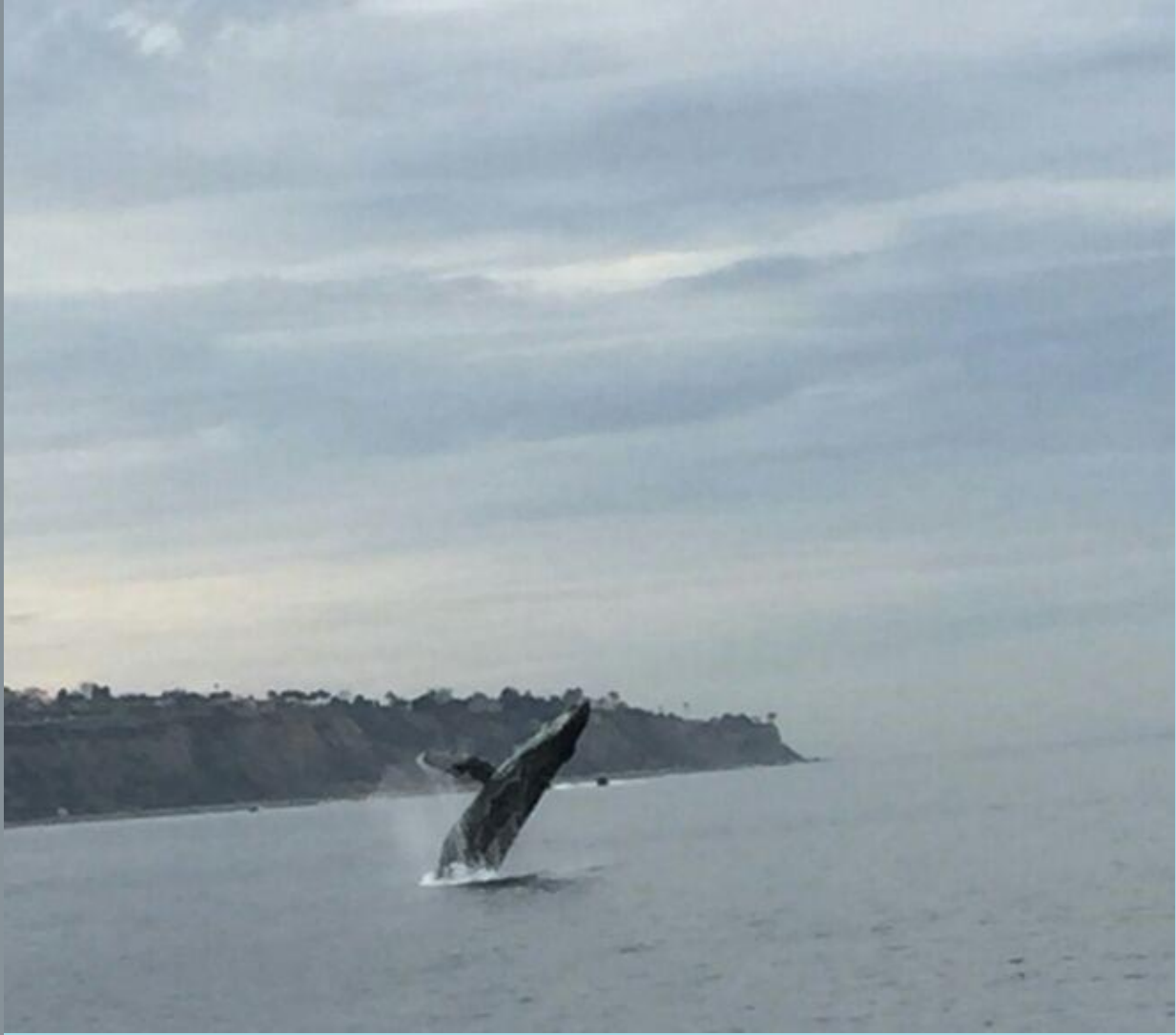
A whale sighting off of Redondo yesterday!