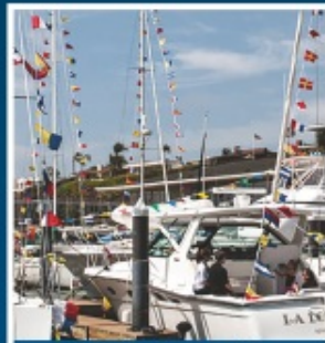
Hosted by: Bahia Corinthian Yacht Club