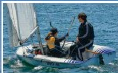
Newport to Dana Point Short Course Dingy Race