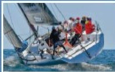
Competitive One-Design Yachts